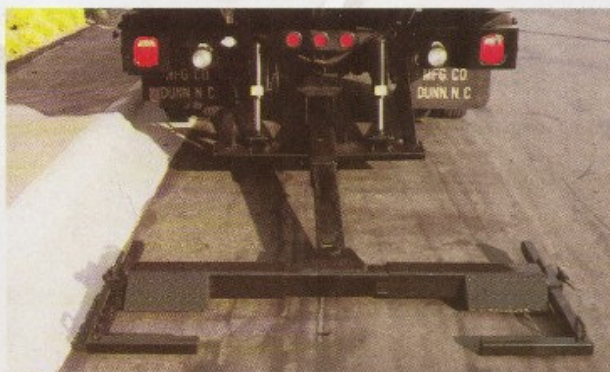
OPTIONAL INDEPENDENT WHEEL LIFT.