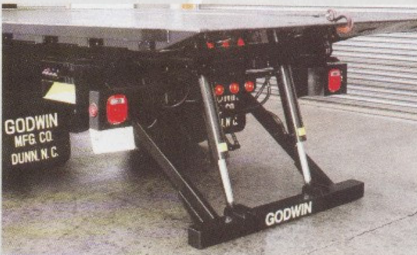
INDEPENDENTLY OPERATED STABILIZER