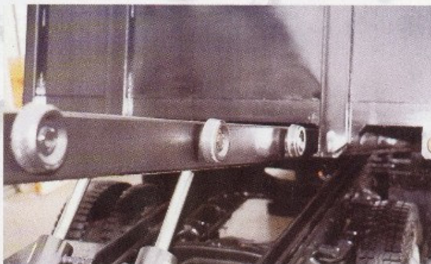
BRONZE BUSHED ROLLERS FOR LONG LIFE AND RUGGED SERVICE.